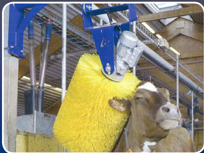
*GST plus $40 documentation fee added to first payment

"Clinical mastitis data in cows in second and higher lactation showed a clear and significant difference in mastitis incidence as soon as the Cowbrushes were installed. The difference in mastitis incidence increased with increasing lactation number... The initial hypothesis was that cows that are more active and walk more, are lying short period of time in the stalls and thereby exposing themselves less to bacteria on the stall surface. Also the grooming behaviour of the cows may lead to an overall cleaner skin in the animals with access to the Cowbrush."